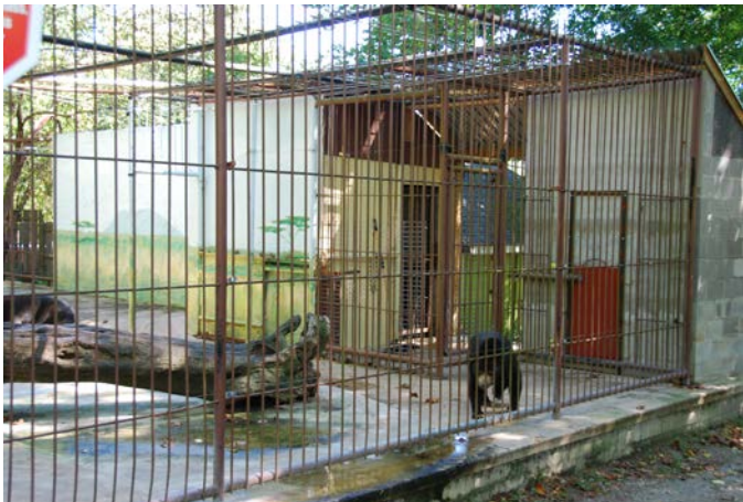
The shockingly inhumane and outdated sun bear cage meets ZAA's inadequate standards. In contrast, the AZA-accredited Oakland Zoo provides its sun bears with 1-acre of natural habitat that allows the bears to climb, dig, bath in a pool, and forage.