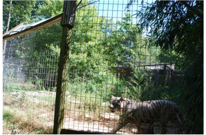
Tigers can jump at least 16-feet vertically, yet this tiger was housed in an enclosure with an estimated 10-foot high fence.