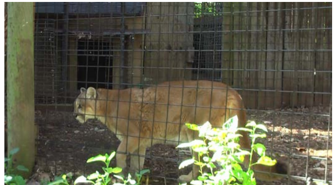
This cougar at Catoctin Zoo was euthanized after being attacked by a wolf in an adjacent cage.