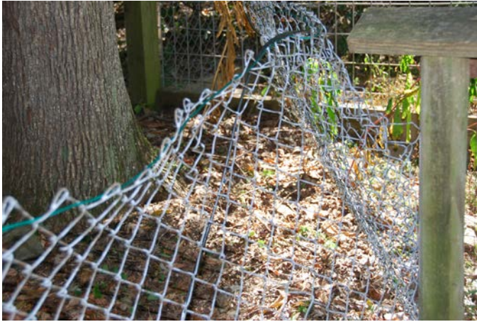
A bent, sagging fence next to a tiger cage could easily allow a child to penetrate the public safety barrier.

In September 2013, The HSUS arranged for two captive wildlife experts with more than 80 years of combined experience to visit and evaluate the Catoctin Zoo. The experts observed injured animals, inappropriate mixed-species exhibits, undersized and outdated cages, poorly designed, unhealthy, and potentially unsafe exhibits, filthy cages, drinking water, and food bowls, a lack of enrichment for many species, and enclosures in disrepair. Following are just a few of many problems found at Catoctin Zoo: