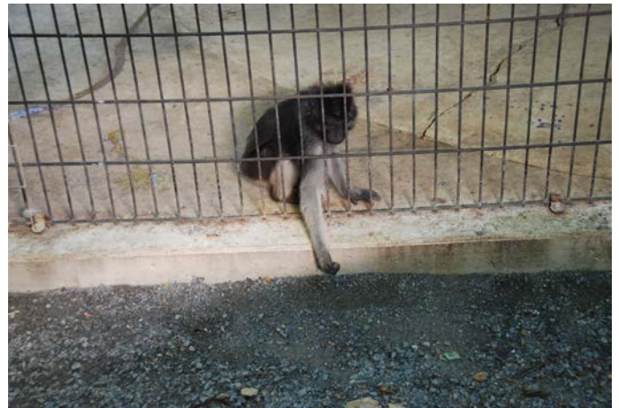
There was no evidence of a comprehensive enrichment strategy to promote the psychological well-being of the many primates at Catoctin Zoo, including this young macaque who tried to entertain himself by grabbing a handful of gravel.