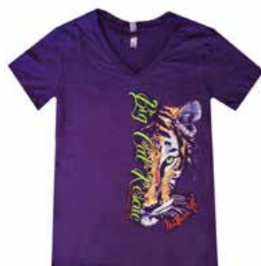
Panthera Tigris V-neck S, M, L, XL $24.40 XXL $26.54