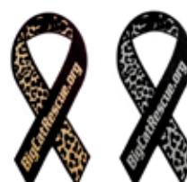
BCR Ribbon Magnet Gold or Silver $8.35