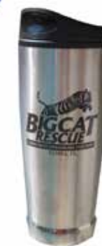
BCR Travel Mug 18.oz $15.84