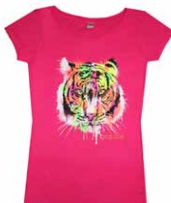
Luminous Tiger, Fitted Cut S, M, L, & XL $24.40 XXL $26.54