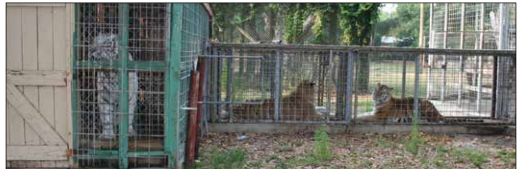
A white tiger, TJ and Bella in small rusty cages at a breeding facility in FL

The key thing now is to build whatever additional momentum we can in these last few months by trying to sign up more cosponsors so we