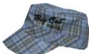
Embroidered Cadet Cap Blue or Pink $20.18