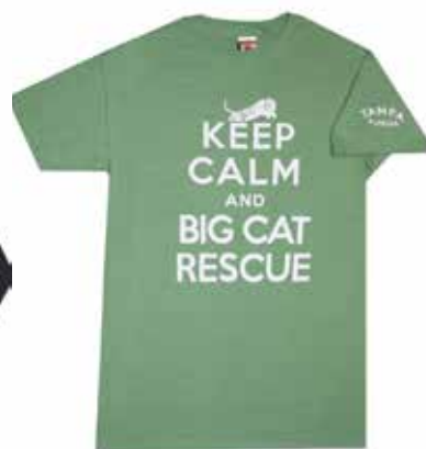
Keep Calm and Big Cat Rescue Green or Orange S, M, L, & XL $19.05 XXL $21.05