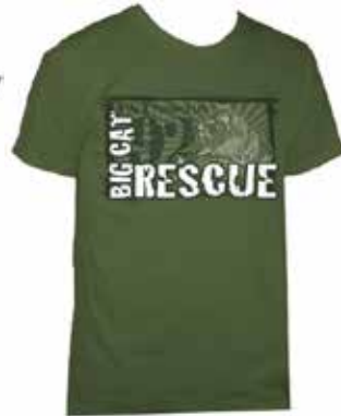
BCR Est. '92 with Cameron Lion S, M, L, XL $24.40 XXL $26.54