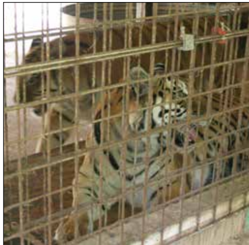
Simba kept as a pet in filth in OH

This bill truly is the only real solution