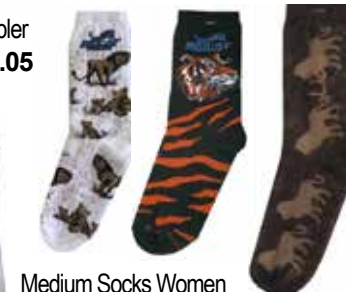
Medium Socks Women 6-11 & Men 5-10 $9.49 ea. Choose White Lion w/BCR Logo, Black Tiger w/ BCR Logo, Lion March, or Shorty Tiger made of recycled materials