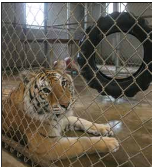
A tiger in FL housed in a shed for years with no access to the outdoors

The important step that needs to happen after a bill is introduced is to have it "heard" in the Committee or Subcommittee that must recommend that it move further in the process. We were thrilled (and somewhat surprised that it happened so soon) that the Subcommittee on Water and Wildlife of the Senate Committee on