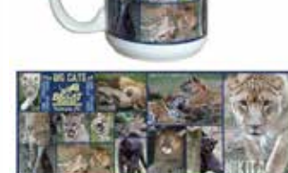
Big Cats Photo 15 oz Mug $15.84