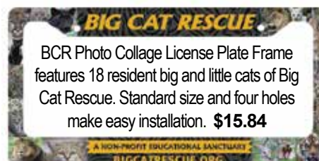
BCR Photo Collage License Plate Frame features 18 resident big and little cats of Big Cat Rescue. Standard size and four holes make easy installation. $15.84