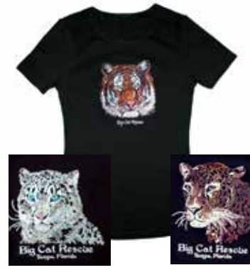
Rhinstone Fitted Cut, Stretchy Tiger, Snow Leopard or Leopard S, M, L, XL $24.40 XXL $26.54