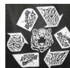
Eco Bag with BCR Recycle Logo 13" W x 10" D x 15" H $13.70

ORDER ON PAGE 10 OR PURCHASE ONLINE AT BIGCATRESCUE.BIZ