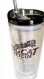
BCR Tumbler 16.oz $17.05