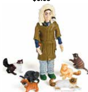
Crazy Cat Lady Toy 5.25" comes with 6 cats $15.84