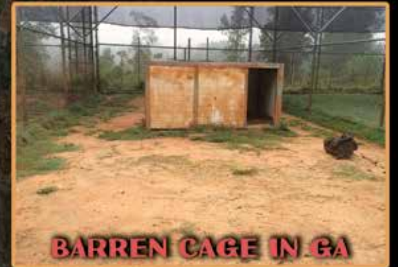
BARREN CAGE IN GA