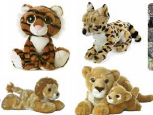
12" Dream Eyes Tiger $15.48 9" Serval $19.05 7" Lionel Lion $8.35 14" Lioness & Cub $35.10