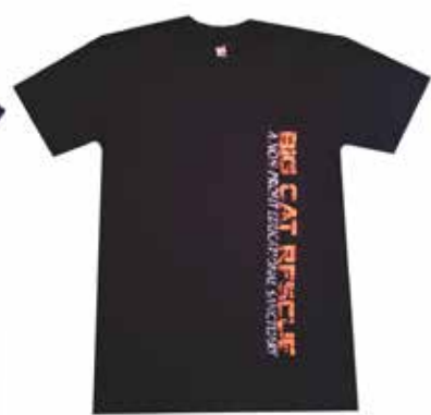
Side Print Big Cat Rescue S, M, L, XL $24.40 XXL $26.54