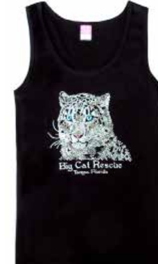
Rhinstone Tank Snow Leopard S, M, L, XL $22.26