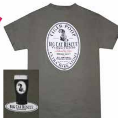
Tiger Poop Brewed Daily at Big Cat Rescue S, M, L, & XL $24.40 XXL $26.54