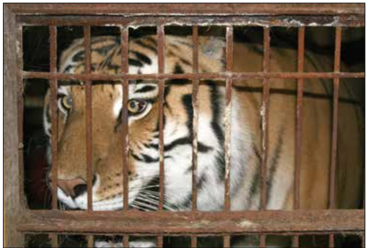
Nakita kept as a pet in a cramped and dirty building in OH