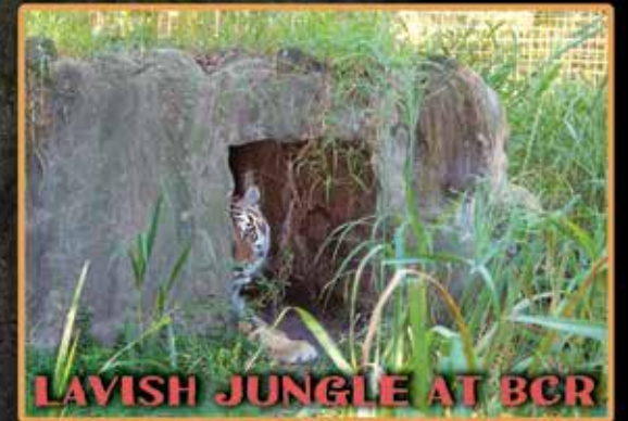
LAVISH JUNGLE AT BCR