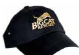
Embroidered Baseball Cap Gold BCR Logo $22.40