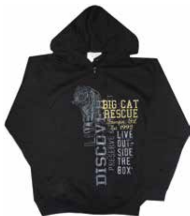
Zipper Hoodie with Tiger Art on Front Black S, M, L, & XL $42.52 XXL $45.73