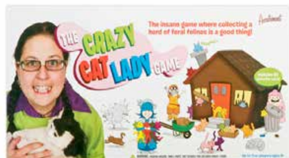
Crazy Cat Lady Board Game $26.54