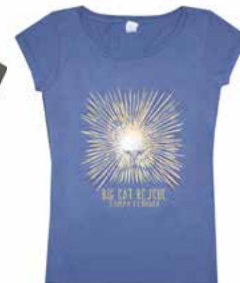
Lion Outburst, Fitted Cut S, M, L, & XL $24.40 XXL $26.54