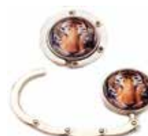
Collapsible Tiger Purse Hook Keep your purse off the floor hang from table. $29.75