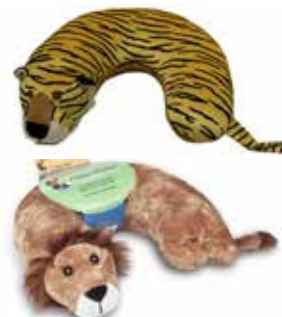
Neck Pillow $13.70 Choose Tiger or Lion