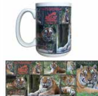
Tigers Photo 15 oz Mug $15.84