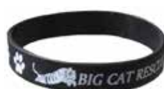
BCR Supporter Bracelet $3.68